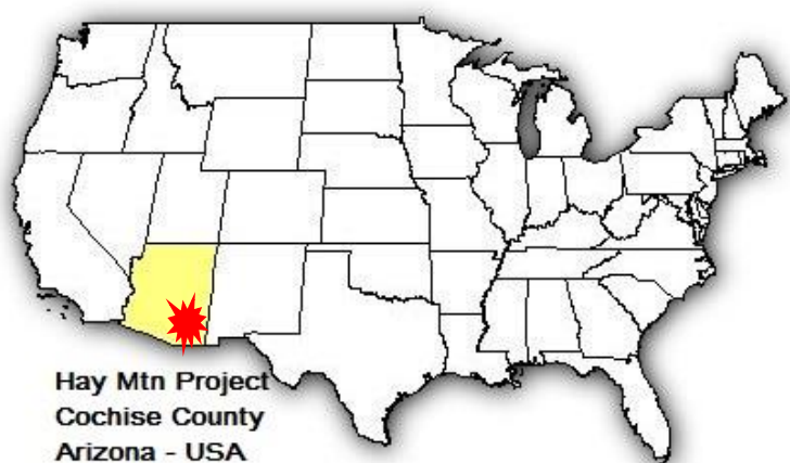
Hay Mtn Project Cochise County Arizona - USA